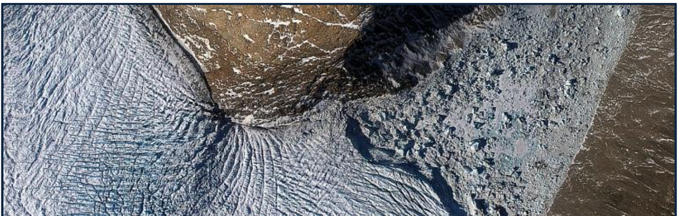
Figure 2: DMS mosaics of the calving front and melt feature.