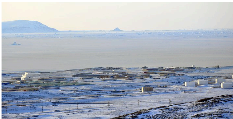
Figure 1: Thule Air Base (76o 32' N, 68o 50' W) and the North Star Bay. Thule is located 695 miles from the Arctic Circle, 947 miles from the North Pole.