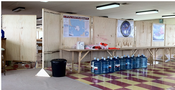
Privacy wall added to OIB operations area.