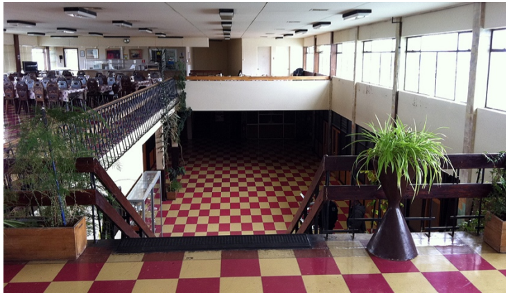
View of the cafeteria from the OIB operations area.