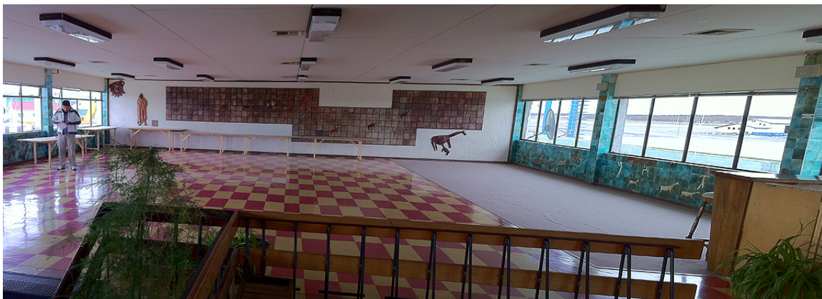
View of the OIB operations area before temporary modifications are added.