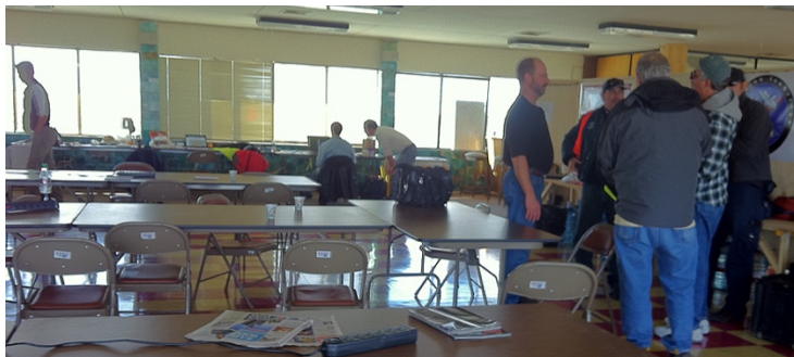
OIB in full operations mode.