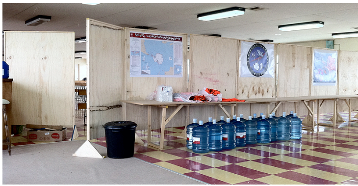
Privacy wall added to OIB operations area.