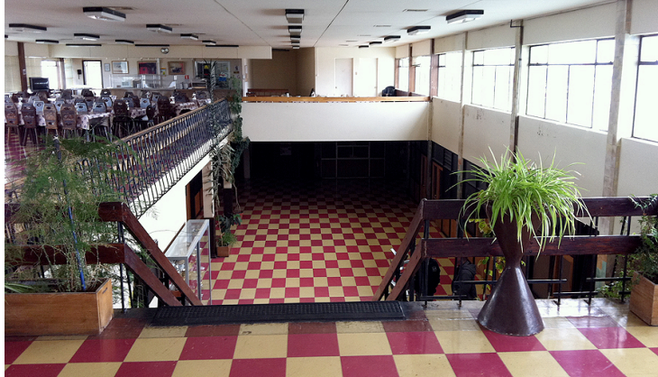
View of the cafeteria from the OIB operations area.