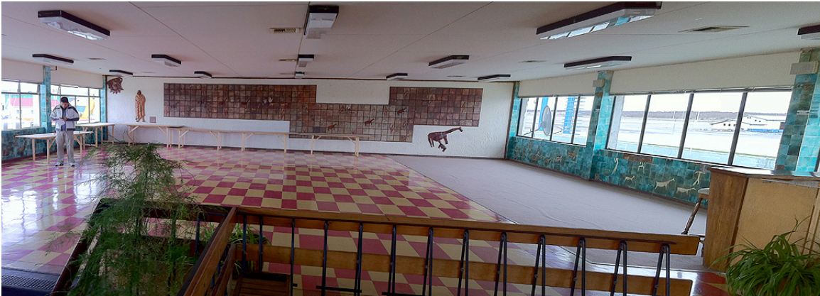
View of the OIB operations area before temporary modifications are added.