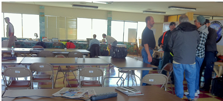
OIB in full operations mode.