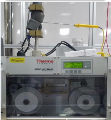
Multi Angle Absorption Photometer (MAAP)