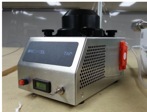
Tricolor Absorption Photometer (TAP)