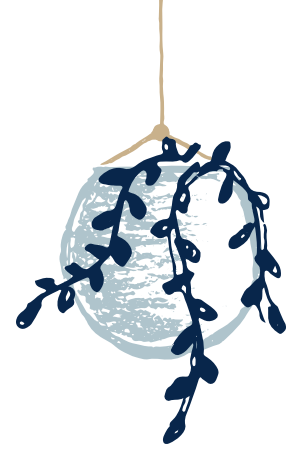
FIG & OLIVE

minutes from preferred hotels and beckman