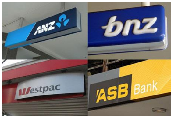
Most common banks in Christchurch

While New Zealand has converted to chip-and-pin style credit and debit cards, you may still use U.S. cards with magnetic strips. The only slight exception is at 24-hour gas stations. If there is no attendant, you must either pay with a chip-and-pin card or with a magnetic strip card that has a PIN number associated with it.