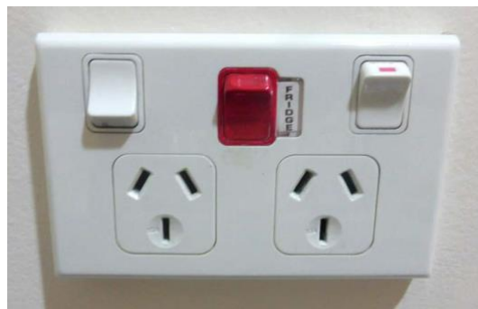
Typical outlet in New Zealand

In other places, electrical plugs supply 230 volts, 50 Hz, and they use an angled two-pin or three-pin plug, the same as in Australia (see photo). Note that the outlets are typically switched off, and must be manually turned on.