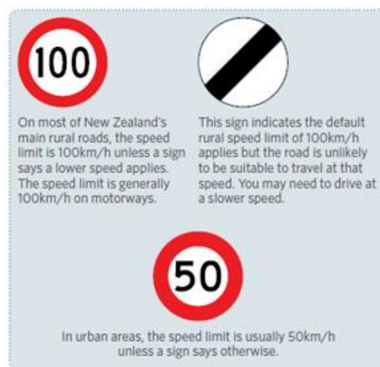
Speed limit signs in New Zealand