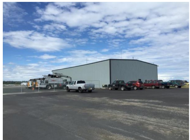
Pegasus GSE Hangar

There are two possible aircraft access scenarios at the