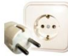
Type F: This socket also works with plug C and E

In Portugal the power sockets used are of type F: