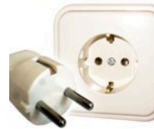
Type F: This socket also works with plug C and E

In Portugal the power sockets used are of type F: