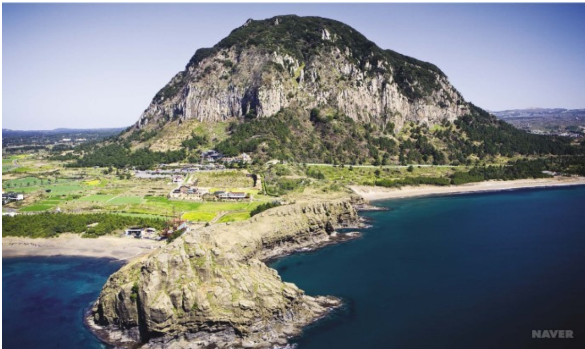
Dragon Head Coast and Mt.Sanbongsan

It is one of the most popular tourist attractions in Jeju visited by 1.5 million people annually. In the museum, visitors can appreciate tea cup gallery, A space for the roasted tea, and tea store. After freshly harvested from the tea field, tea leaves are roasted by a professional master whose performance is appreciated by the visitors on site, and can be purchased under reasonable prices. In this area, there is another building which is the popular Korean skincare brand, Innisfree Jeju house, sources all of its main ingredients from the island of Jeju. There are products containing volcanic clay, Jeju tangerine, lava water and green tea. Visitors also can enjoy a large area of a green tea field outside.