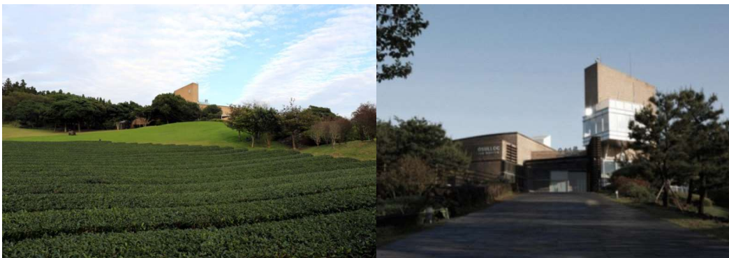
Osulloc Green Tea Field & Tea Museum

17:00-18:00 Come back to Ramada Encore Hotel