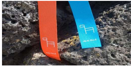
Jeju Olle Trail's orange and blue ribbon way-markers set against a traditional volcanic stone wall.